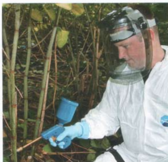
Effective: only one herbicide treatment is necessary to destroy the weed

The system is being hailed in the US as an environmentally friendly